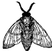
Figure 2: A sample black and white graphic that has been resized with the \includegraphics command.

you choose to use latex and dvipdf to typeset your paper, you may only include .ps , .eps files. More details on each of these is found in the Author's Guide .