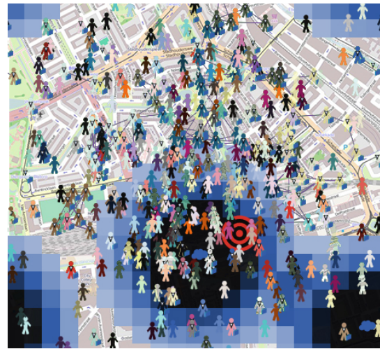
Figure 2: Visualisation of data aggregation. Lines between users (not to scale) indicate data aggregation, adjacent users with the same colour indicate a cluster where only one in that cluster is providing data. Rainclouds are indicated with blue and black squares.

We have constructed a simulator of a new request driven social sensing crowdsourcing system, which incorporates checking use policies against requests, modeling strategic behaviour of self-interested users and smart network selection. This tool allows checking the influence of each of these component’s functionality on the total system performance, defining performance as the number of requests per time unit that are satisfied to a certain extent and measuring it. We can also test the relationship between user behaviour and what is specified in their use policy and requests. This