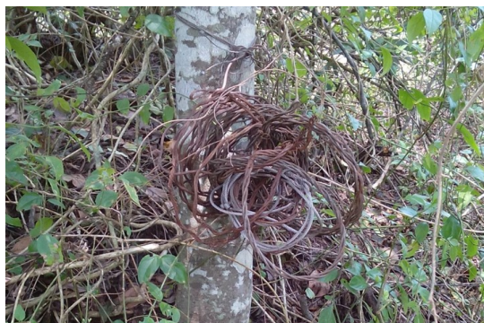
Figure 3: Elephant snare roll found by rangers directed by INTERCEPT.

After our extensive modifications to the CAPTURE model and our subsequent evaluation, it is important to identify the reasons why we obtained such a surprising result: decision trees outperformed a complex, domain-specific temporal model. (1) The amount of data and its quality need to be taken into consideration when developing a model. The QENP dataset had significant noise (e.g., imperfect observations) and extreme class imbalance. As such, attempting to develop a complex model for such a dataset can backfire when there does not exist sufficient data to support it. Our decision tree approach, generally regarded as simpler, benefits from being able to express non-linear relationships and can thus