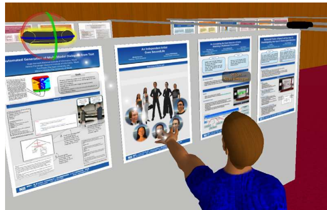
Figure 1: Example of a developer avatar adjusting simulated sensors in our testbed in Second Life.

Copyright © 2008, International Foundation for Autonomous Agents and Multiagent Systems (www.ifaamas.org). All rights reserved.