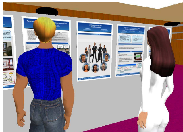
Figure 3: Visitor avatars are being tracked to gather statistical data while visiting the poster session.

Our example scenario uses RFID tags attached to visitor avatars (Fig. 3). Since RFID sensors can only sense RFID tags in their vicinity, the (simulation) task is to position a RFID sensor network that would allow us to track the positions of visitor avatars. A simplified version of the system described in [2] is used for user tracking (here visitors).