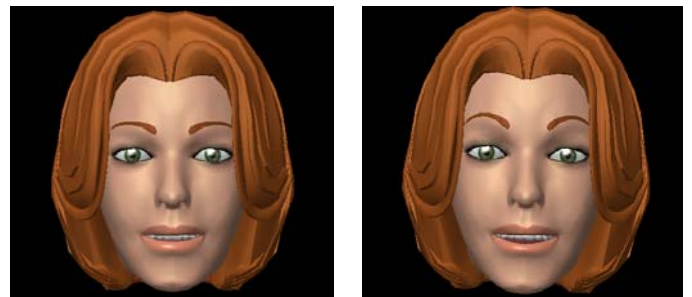
Figure 5. Expressions for recommend (left) and suggest (right).

The corresponding expression for Greta (Figure 5- left) consists of a recommendation with an emphasis on the deontic verb “ il est recommandé ” (it is recommended) and a raised eyebrow, while the suggest communicative act (Figure 5- right) is associated to a slight raising of the eyebrows and a head nod.