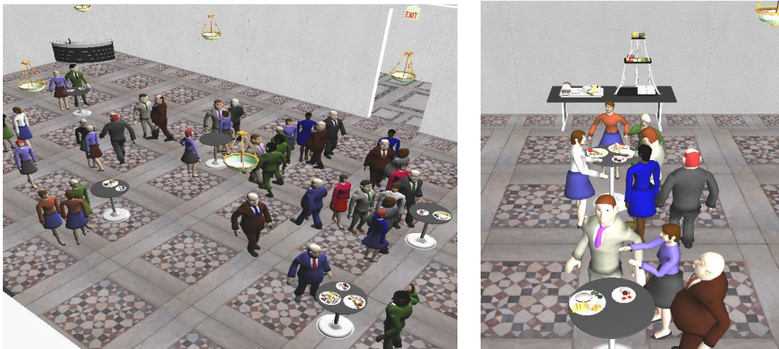
Figure 1. Virtual crowd in a cocktail party.

After completing the task, subjects were administered a questionnaire to help us determine the level of presence that they experienced during their time in the virtual environment. They were questioned about their experience with video games and virtual environments to ensure that the independent variable (the different crowd models) was the only contributing factor to the differences in achieved presence.