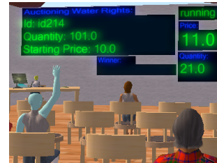
Figure 4: Bot bidding in a running auction

artificial skin colours that represent their roles (see Figures 3 and 4). Fig. 3 shows the login to the institution: the human participant sends a private message to the Institution Manager bot with the password and role (either seller or buyer). Fig. 4 illustrates how human participation in the auction has been improved by providing a comprehensive 3D environment. There, the market facilitator bot appears sited at a desktop and buyer participants at the chairs in front of it. This room includes dynamic information panels. Moreover, bots' bid actions can be also easily identified by human participants since they are displayed as raising hands.