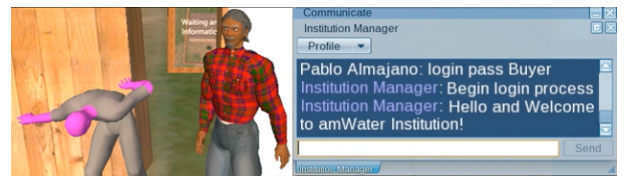
Figure 3: Human avatar login: interaction with a software agent by means of a chat window