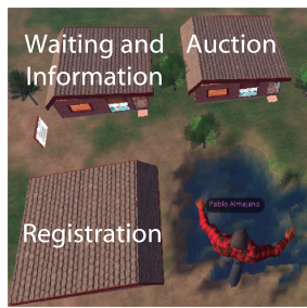
Figure 2: Initial aerial view of v-mWater

market facilitator conducts the auction and the basin authority announces the resulting valid agreements.