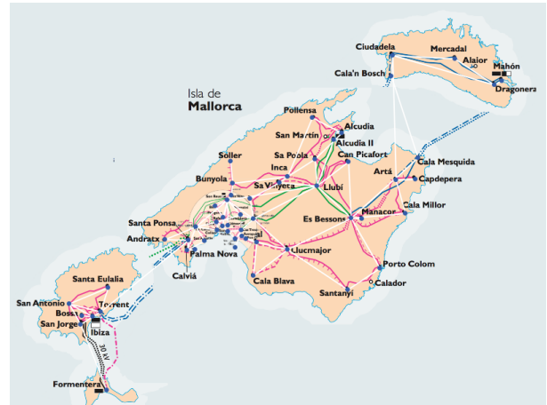
Figure 1: Electrical network in Balearic Islands. The color of the lines represents its capacity

Appears in: Alessio Lomuscio, Paul Scerri, Ana Bazzan, and Michael Huhns (eds.), Proceedings of the 13th International Conference on Autonomous Agents and Multiagent Systems (AAMAS 2014), May 5-9, 2014, Paris, France. Copyright © 2014, International Foundation for Autonomous Agents and Multiagent Systems (www.ifaamas.org). All rights reserved.