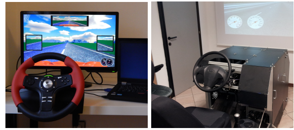
Figure 2: OpenDS drive simulator installation (left) and industrial stationary driving simulator with a SCANer TM simulation engine (right). In the left part, the screen shows basic AI-based drive guidelines by the color projections (left blue lane represents change lane recommendation).