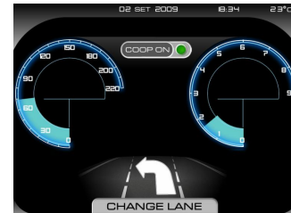
Figure 3: Example of the HMI dashboard for stationary driving simulator.

systems testing. Its openness and flexibility supports a wide range of testing and validation possibilities for the researchers and developers in the field of autonomous vehicles, cooperative drive, driver assistants, and HMI design and development. The system has been validated in the various settings of the integrated driving simulator, HMI interfaces, and cooperative car control techniques. The demonstration supports the usability and validity of the simulation for future car systems.