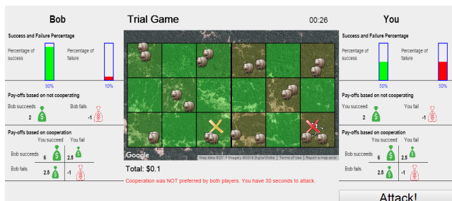
Figure 1: Hunters vs Rangers game interface

decisions about: i) whether they are inclined to cooperate with the other player or not and ii) which region of the park to put their snare (trap) where there is less chance of getting caught and also a high chance of capturing a hippopotamus. So the human subjects may decide to attack "individually and independently" or attack "cooperatively" with the other