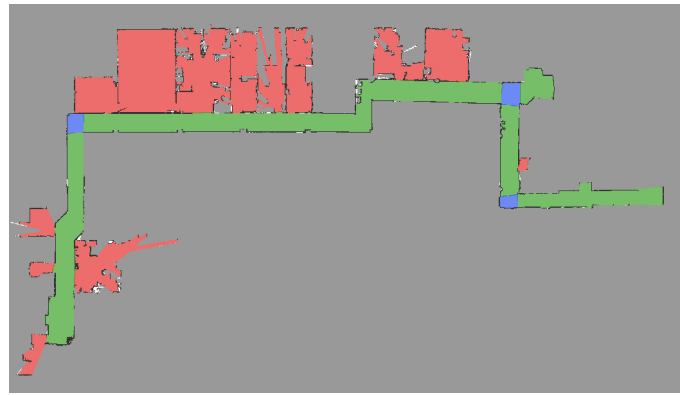
Figure 4: Metric-topological map of the demonstration environment. This 44m x 75m map was produced by running Vulcan’s metric SLAM and place classification algorithms on sensor data of the wheelchair being manually driven through an environment. Color indicates the “type” of each region in the topological map: decision points are blue, path segments are green, and destinations are red.

In this paper, we make three primary contributions. First, we demonstrated how the integration of the Vulcan and DIARC architectures produces a hybrid architecture with not only the capabilities of both architectures, but new synergistic capabilities as well: by leveraging Vulcan, DIARC can navigate through environments, Vulcan can initiate actions based on flexible natural language requests, and as a whole, Vulcan-DIARC can now travel to previously unknown objects that are learned about in one-shot through natural language, a capability previously held by neither architecture.