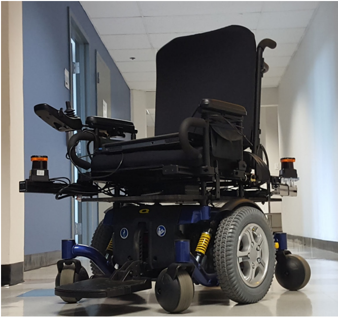
Figure 1: The Vulcan Intelligent Wheelchair

what is brought to the table by both Vulcan and DIARC, but because they promise to be of great benefit to society. Within the United States alone, there are at least 3.6 million wheelchair users, 40% of whom find it difficult or impossible to control a wheelchair using a joystick [7, 12]. To make wheelchairs more accessible, many researchers are turning to Natural Language (NL) as a control modality. While such NL-enabled wheelchairs have existed for nearly forty years (e.g., [10]), even many of the most recently presented NL-enabled wheelchairs have only limited capabilities, e.g., the ability to be commanded to go forward, left, right, backwards and to stop [2, 3, 6, 19, 20, 22, 23, 31, 32, 34, 38, 40, 39, 44, 45]. There have, however, been a small number of recent wheelchairs also capable of following walls [30], entering elevators [25], traveling to nearby objects [14], or traveling to named objects and locations [13, 24, 26, 29, 33, 42].