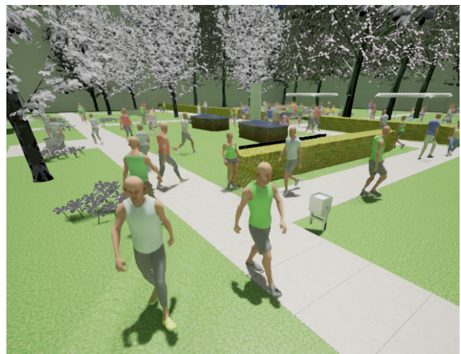
Figure 1: Example of a MISER configuration setup with virtual background agents evolving in an open-space virtual world.

Copyright © 2017, International Foundation for Autonomous Agents and Multiagent Systems (www.ifaamas.org). All rights reserved.