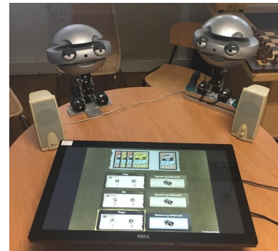
Figure 2: Playing For The Record game with the two robotic partners.

achieved by playing over a touch screen and enjoying the social interaction with the robots (see Fig. 2).