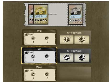
Figure 1: Interface of For The Record at the level up phase, where each player chooses to upgrade the instrument (cooperate) or to upgrade the marketing (defect).

We propose a demonstration of For The Record in which a human player teams up with two social robots 1 . Introducing these type of social dilemmas in Human-Robot Interaction allows the analysis of prosocial collaboration and, more generally, the exploration of new approaches for robots to promote prosociality on humans.