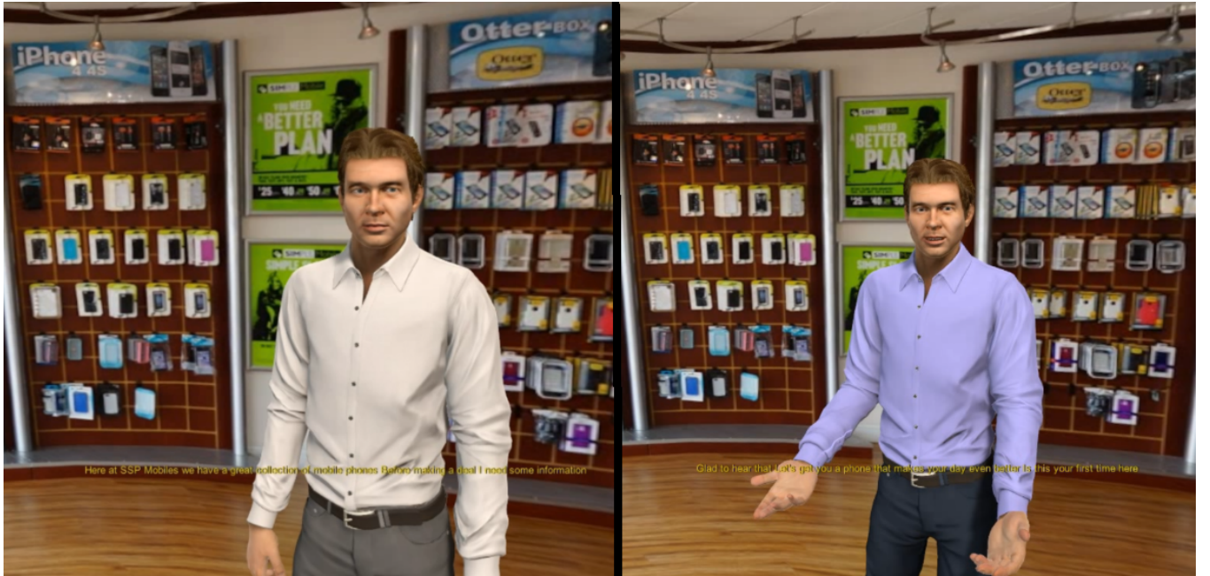
Figure 1: The agent plays the role of a mobile stores salesman. The cold version is on the left, the warm version is on the right.

was programmed to frequently change his direction of gaze during the conversation.