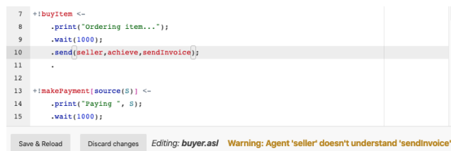
Figure 1: Understandability warning.

Furthermore, continuous deployment requires fast quality assurance functionalities. Jacamo-web provides facilities such as code highlighting and code completion that increase efficiency and help prevent mistakes, but comprehensive test measures are needed for updates. Our extension performs tests on temporary running instances. This allows the framework to check compatibility using the real scenario.