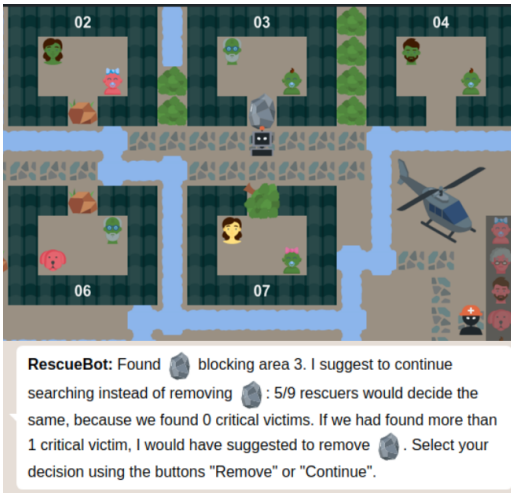
Figure 1: Cropped image of the world used during our study.

Whenever RescueBot found an obstacle or victim, it provided decision support using suggestions and explanations based on crowd sourced data (Figure 1). More specifically, nine people were shown our environment, confronted with task dilemmas, and asked to make decisions and which features contributed most to these decisions. We used this data to generate one suggestion and confidence explanations, feature attributions, and counterfactual explanations. Next, we manipulated communication of these explanations by implementing non-user-aware, trust-aware, performance-aware, and workload-aware agents. The non-user-aware agent did not model the human user and for each decision randomly adapted its provided reasoning information. The trust-aware agent modelled user trust in the agent based on the number of followed and rejected agent suggestions. This agent increased its provided reasoning information when predicted trust decreased (and vice versa) [4, 16, 29]. Next, the performance-aware agent modelled user performance based on the difference between the predicted and real-time score of the task. This agent increased its provided reasoning information when predicted performance decreased (and vice versa) [4, 16, 29]. Finally, the workload-aware agent modelled user workload during the task based on cognitive and affective load [6, 19–21]. This agent increased its provided reasoning information when predicted workload decreased (and vice versa) [4, 24, 28].